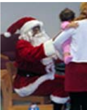
Santa exchanged gifts for smiles at the Library's year-end party.