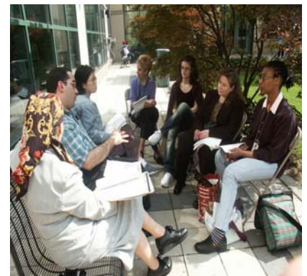
“Short Takes “ Summer gathering.

All faculty and staff, as well as students, are welcome to join the discussions. We can even welcome classes with the understanding that no pedagogical hierarchy is allowed. The “Short Takes on Literature” group usually meets on the third or last Tuesday of every month from 3:30 to 4:30. The reading selections are posted in advance and copies are made available in the Library. For more information, please call me at x5434.