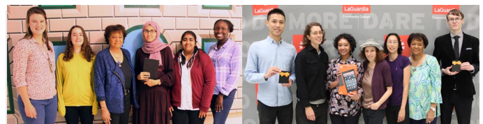
2019 Competition Winners